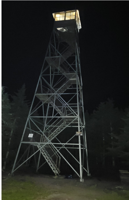
Balsam Lake