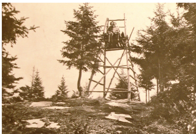
Vanderwhacker Fire Tower 1917