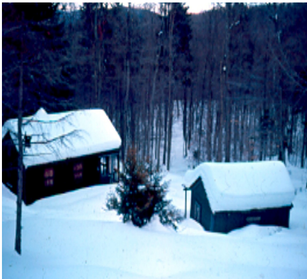
Vanderwhacker Cabins date unknown

November is the time the Fire Tower Observer of the past was busy closing up their towers for the year. Depending on the year, they were carrying those heavy battery packs down out of the tower, putting away their binoculars, removing any clothing left in the cabin so that the mice did not use it to nest in. They turned the chair upside down on the table for the winter and secured the shutters. Some anxiously awaited this day as it meant a change to another job or time to grab their rifle and go hunting. Sometimes (but not routinely) it was time to stay on the mountain as the fall fire season was a busy one.