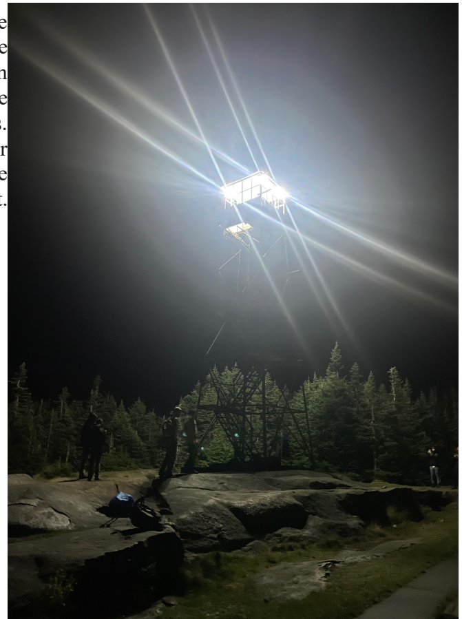
Blue by Tara Anne Pleat