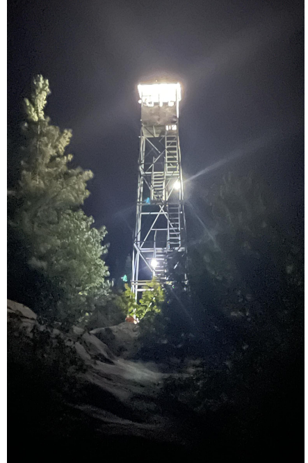
Bald

As we approach holiday shopping time, please take time to seek out organizations that support fire towers. Friends of groups generally have their own websites and merchandise sales. A quick google search generally brings you to their offerings. Meanwhile, if you would be able to support our work through your membership or a donation, we would greatly appreciate it. http://ffla.org/index.html